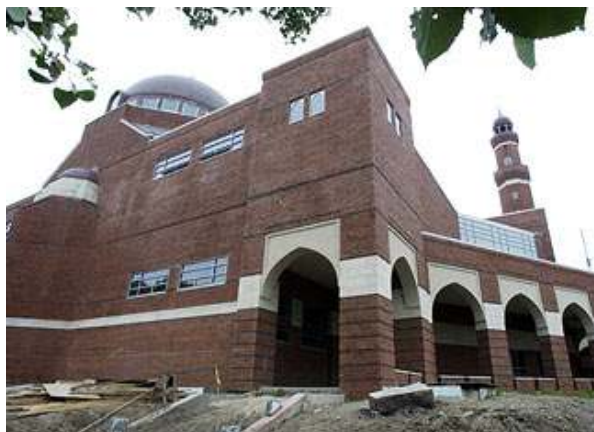
Nearly ready: Boston's hard-won house of prayer

The terms of the mosque debate vary widely: in the United States, mosque projects often meet practical objections, to do with “zoning”, water supplies or parking, but they are usually overcome, helped by a legal system that protects all faiths. In southern European countries like Spain and Italy—where attachment to Catholic symbolism is strong—people are much blunter about expressing their objections in cultural terms: this is a Christian land, and mosques have no place here.